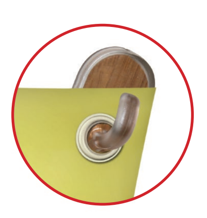
FAST AND EASY SET UP

Simply place banner grommets on each corner hook of the stand.